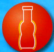
瓶身到底型 FULL BODY LABELING TYPE

Various label insertion methods operated by PT-XYP series shrinkable label inserting machines