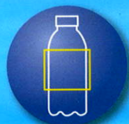
瓶身中間定位型 MIDDLE BODY LABELING TYPE