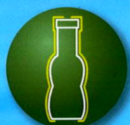
整瓶型 OVERALL BOTTLE TYPE