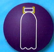
瓶口型 CAP SEALING TYPE