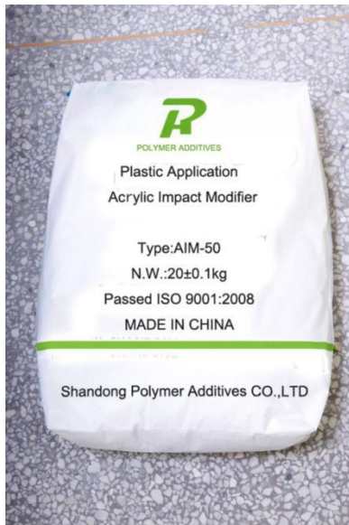
20kg/bag with PP bag